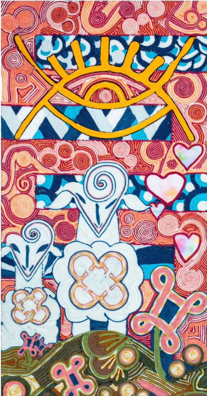
Feed My Sheep | Nicolette Peñaranda Yarn and paper collage on canvas