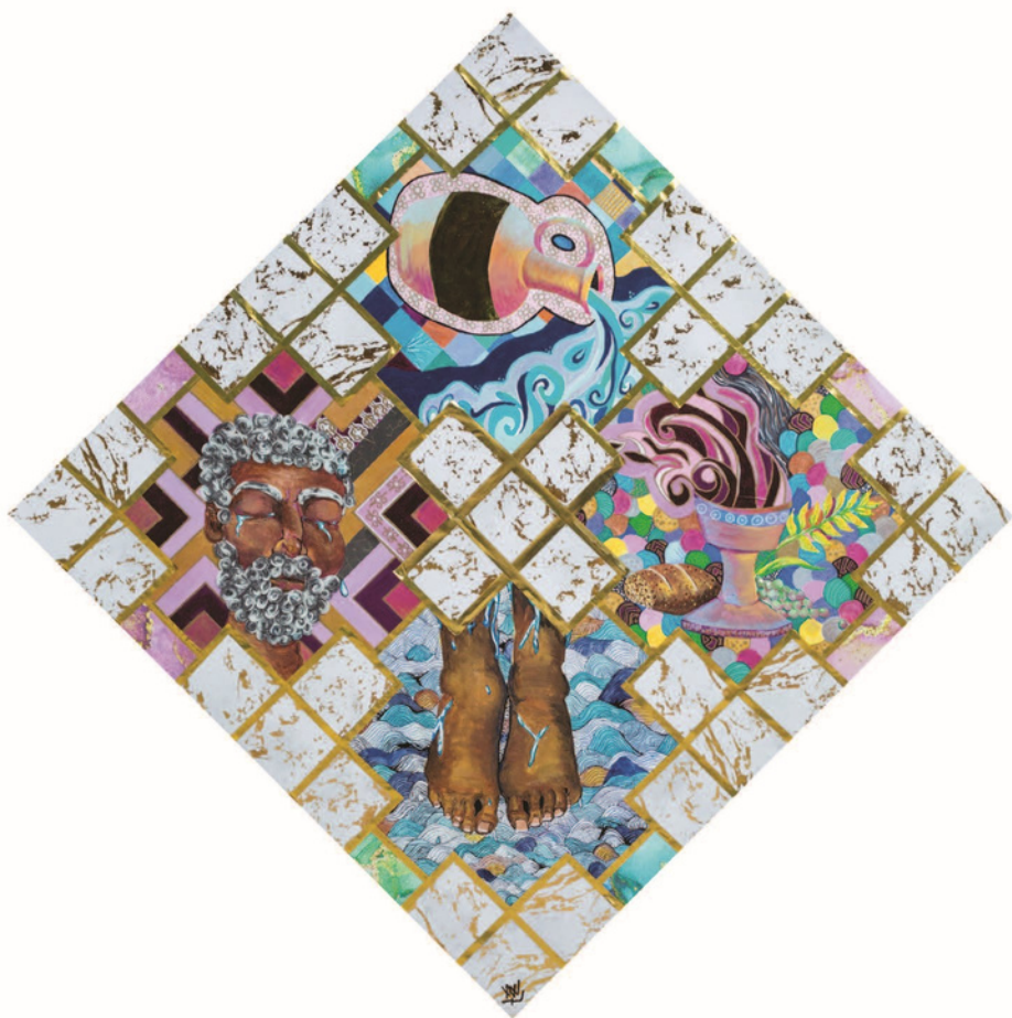
Golden Hour | Rev. Nicolette Peñaranda Acrylic, ink, paper collage, yarn, metallic tape, and mixed media on canvas